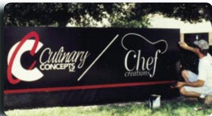
Sign installation signals the "Chef" is in!