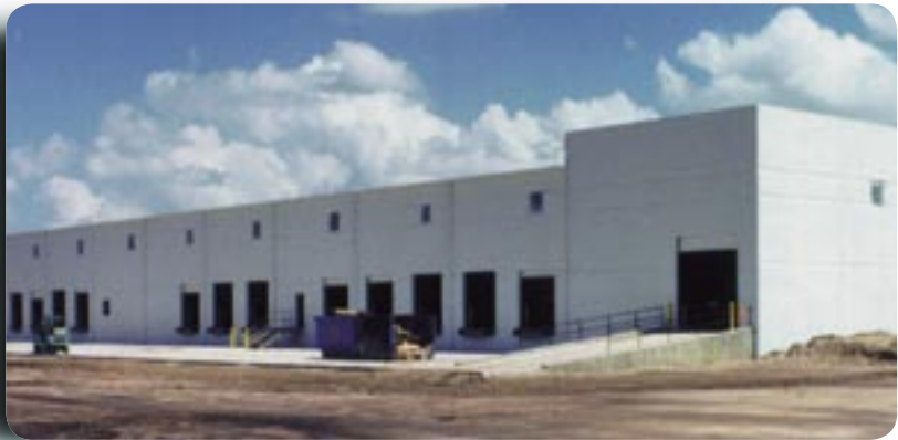
Nabisco facility construction underway

Hartrich Construction LLC, general contractors, is heading up the construction team. Subcontractors include Abbott True Electric, Irvine Mechanical, Tharp Plumbing, Total Site Development and Martin Concrete Construction.