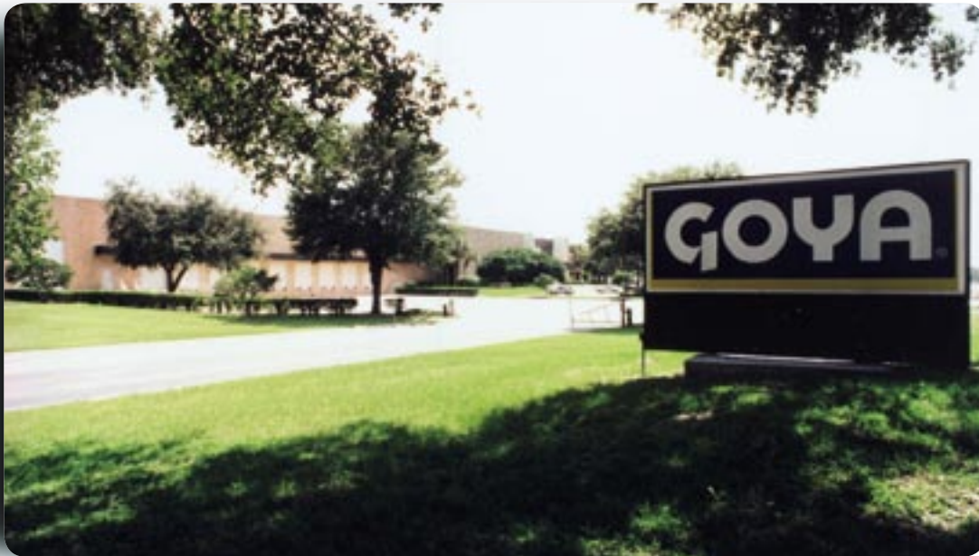
Goya Foods Gets Spicy New AIPO Location

rail served facility was sold late last year. Located on 8.06 acres, the building has frontage on South Orange Avenue. Goya set up shop earlier this year. 🇺🇸