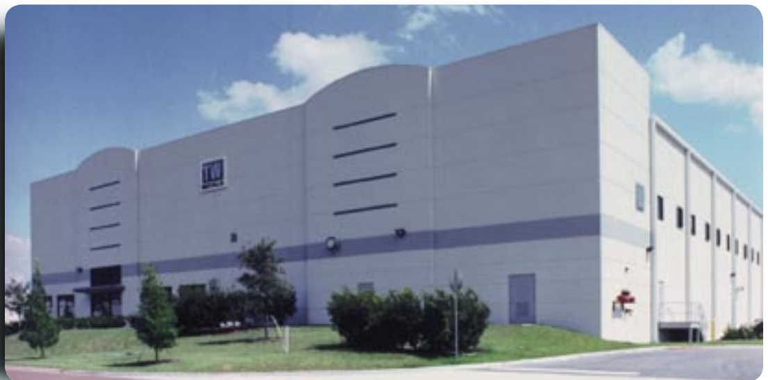
Metal fabrication facility gets down to business in AIPO

TW Metals, Inc.'s new 40,000 SF manufacturing facility is complete. Liberty Properties Trust developed the build-to-suit facility on 5.14 acres in the Park. Edwards Construction Company provided general contracting services. 🏡